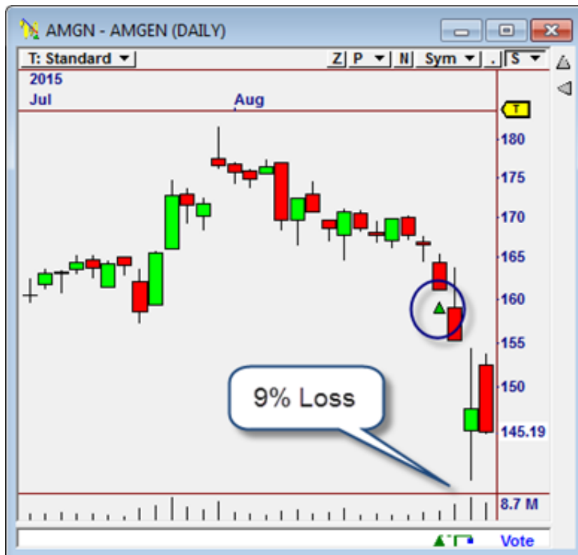
MVX-15, without the MVX Signal Filter, fired a signal on August 20th which resulted in an almost 9% loss.