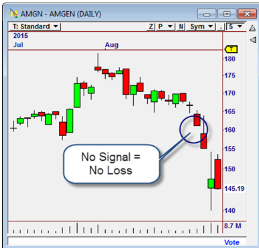
With the MVX Signal Filter active in MVX-15, excessive volatility is detected and the unnecessary loss is avoided.