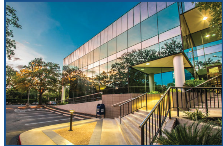
Nirvana Systems Inc., Headquarters in Austin, Texas

ARM5 RTM-17 comes with OmniTrader Professional, our automated trading software platform AND our unmatched 90-Day Guarantee! If you are interested in building wealth automatically, you owe it to yourself to learn more about ARM5 RTM-17.