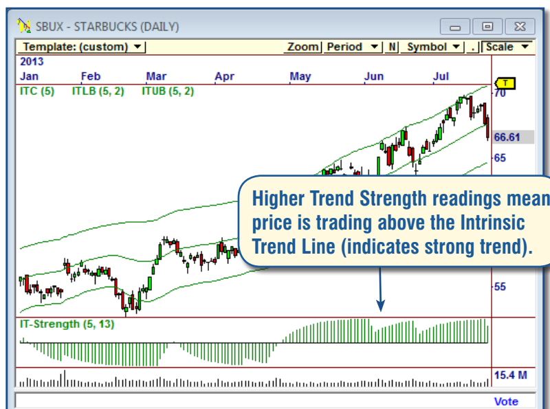
The Trend Strength Indicator measures price activity relative to the Intrinsic Trend Line, indicating strength of trend.

These indicators provide good visual confirmation of trend. They are also used as powerful “filters” in the included ITM Strategies. Combining the Intrinsic Trend Line with these indicators provides the best possible trend-following Signals (see page 6).