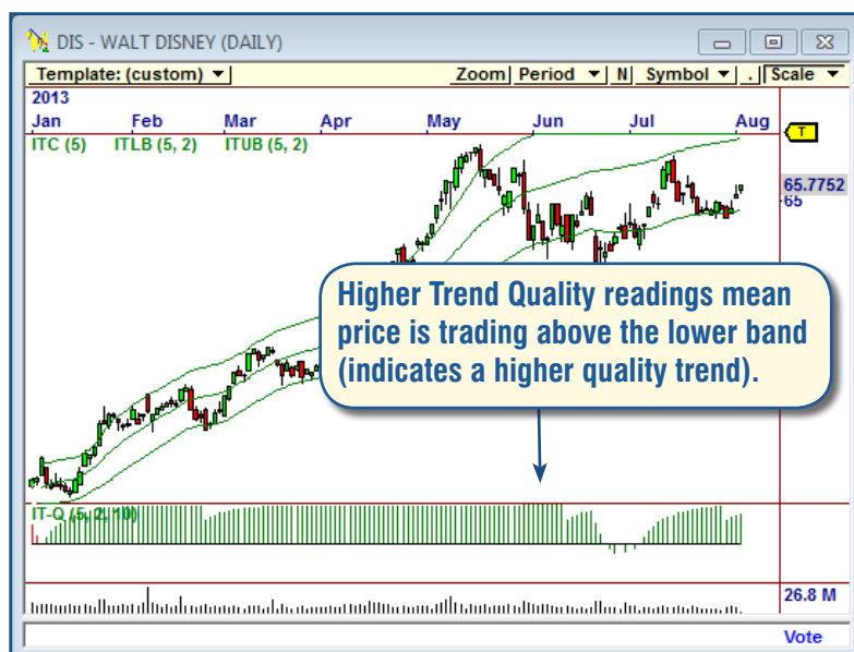
The Trend Quality Indicator measures the position of price relative to the lower band, indicating quality of trend.