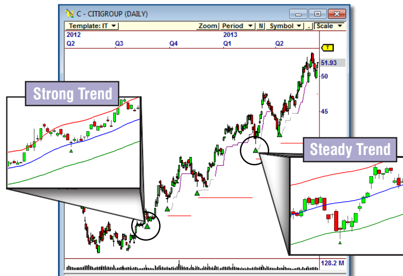
We have activated both ITM Strong Trend and ITM Steady Trend to show the superb Signals they generate.

Examples of both Signal types are shown to the right for Citigroup (C).